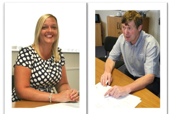
ASW Customer Services Advisor and Contract Manager for the NPT Homes Voids Contract