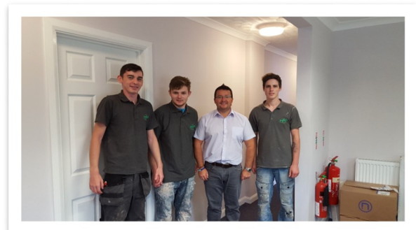
ASW Managing Director offering full-time contracts to former Cyfle shared apprentices working on NPT Homes Contracts